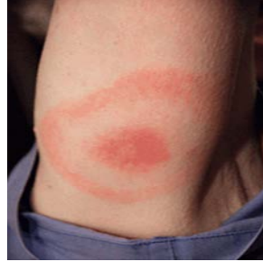
Bulls -eye rash