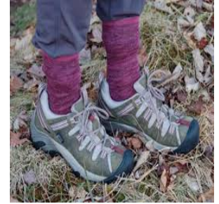
Prevent tick bites

Help protect yourself and your family whenever you enjoy the outdoors by: