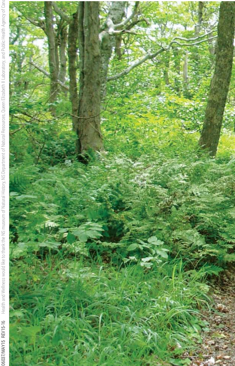
Health and Wellness would like to thank the NS Museum of Natural History, NS Department of Natural Resources, Queen Elizabeth II Laboratory, and Public Health Agency of Canada for their assistance with this pamphlet. 06037/MAY15 REV15-16