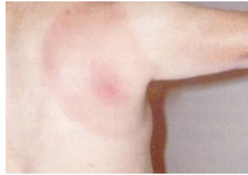
Bull's eye rash

It is very helpful to know if and when you've been bitten by a tick and to know the symptoms of Lyme disease. This is because a health care provider will use your symptoms, the likelihood that you've been bitten by a tick, and sometimes a blood test, to diagnose Lyme disease.